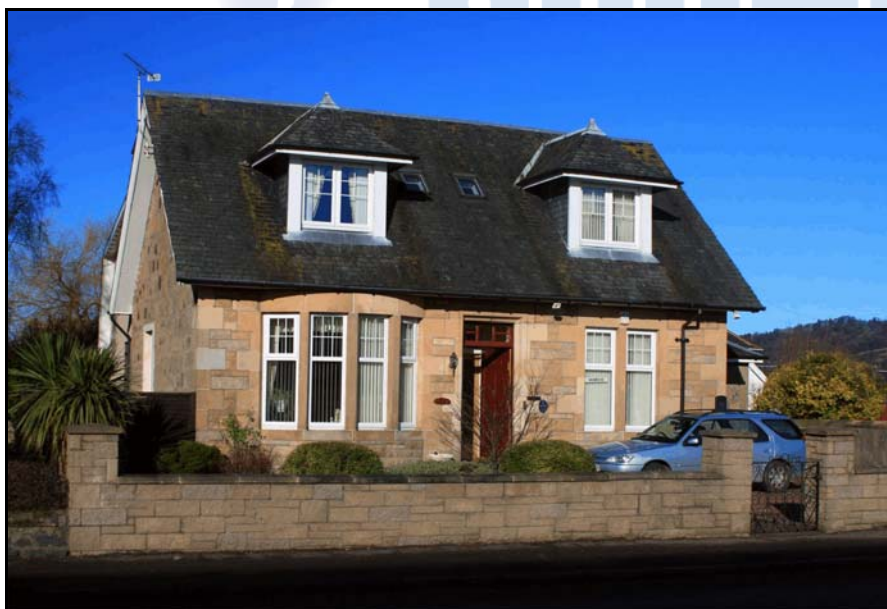
"The Haven," Causewayhead, Stirling: Future home of Mission Scotland?

At current exchange rates, we need about $650,000.00 to purchase this property, which is a very good deal. The owner is willing to take a long closing date, giving us until the end of June to raise the necessary funds. Would you please join us in praying for God to provide the finances needed for this exciting opportunity? If you have any questions, please contact us. And, if you feel so led, donations can be sent to the address in the box below. Just designate them "Scotland property fund." Thank you.